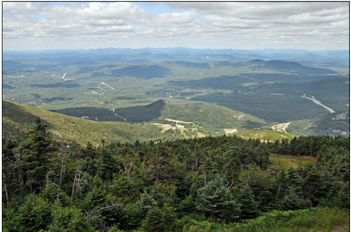
A view as seen from the observation deck on top of Cannon Mountain, NH. From the observation deck, one need only pivot in place to see an unobstructed 360 degree view in all directions. On a clear day, like the day the Chapter visited the mountain, one could see forever.