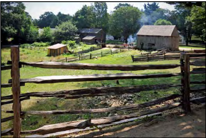
A typical 1700s-1800s country scene is replicated at Sturbridge Village. In the background with the smoke rising vintage women are demonstrating how wool in that era was dyed in any number of colors.