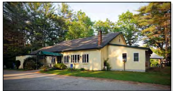
The Country Cow Restaurant, Campton, NH

There were no pull-thrus, but those who needed help backing up got all the