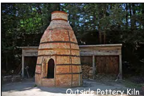
Outside Pottery Kiln