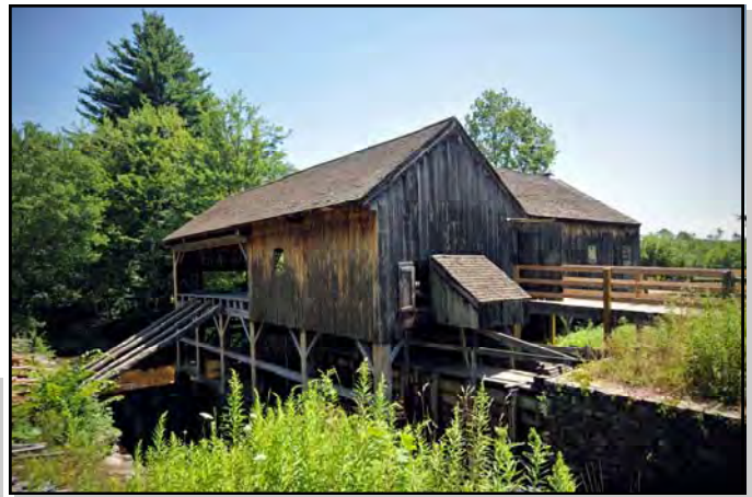
An operating vertical sawmill at Sturbridge Village was moved their from its original location in Bow, NH.