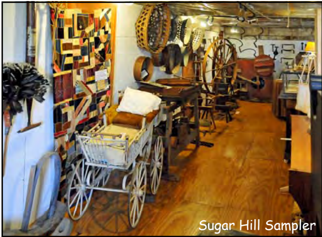
Sugar Hill Sampler