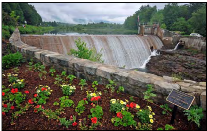
A landscaped dam located along the highway as one approaches the Goose Hollow Campground, Thornton, NH.