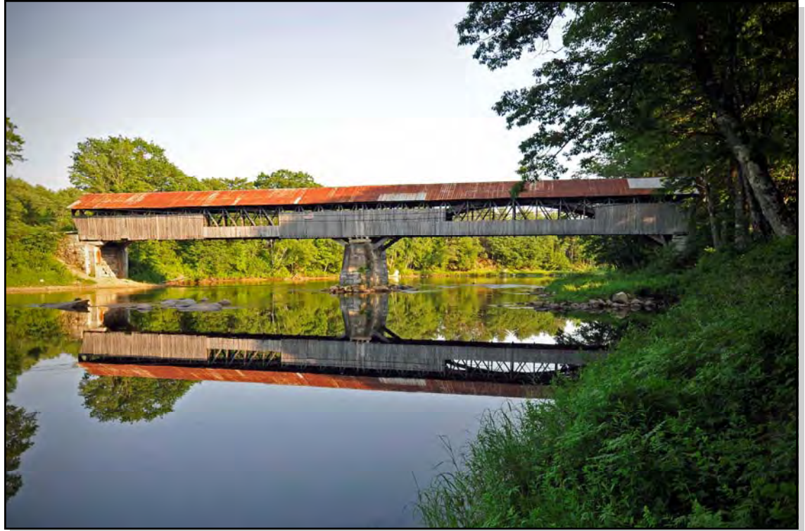
Those eating at the Country Cow Restaurant, on the shores of the Pemigewasset River, Campton, NH could eat and enjoy the scenery including the Blair Covered Bride. This bridge was originally built in 1869, and most recently restored in 1977. It is 293 feet in length.