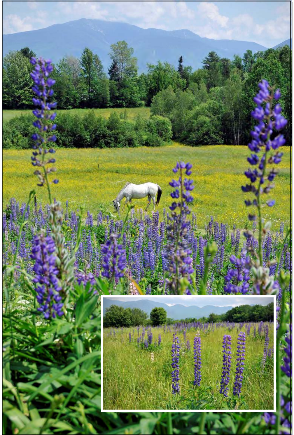
Sugar Hill, NH —Following a shopping spree at the Sugar Hill Sampler and a great lunch at Polly's Pancake Parlor, the White Mountain Rambles took a walking tour among the lupines as part of the Lupine Festival being celebrated in the area. Additional photos of the lupine scenery are contained on the "Album Section" of this newsletter.