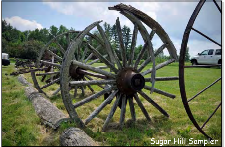
Sugar Hill Sampler