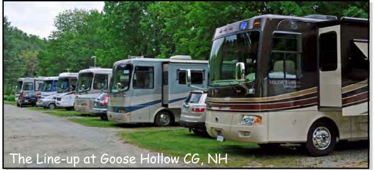
The Line-up at Goose Hollow CG, NH