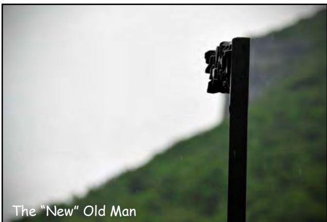
The "New" Old Man