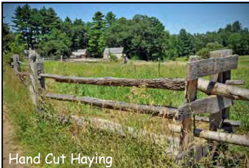
Hand Cut Haying