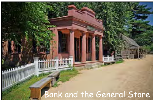
Bank and the General Store