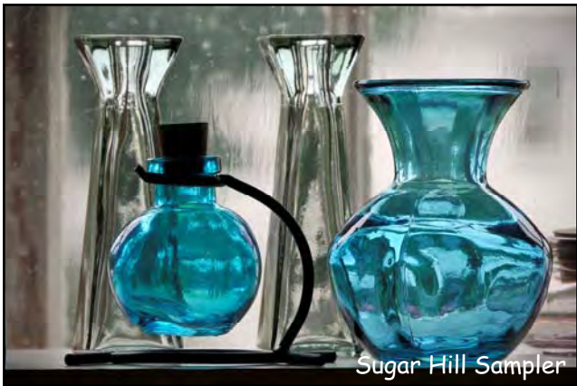
Sugar Hill Sampler