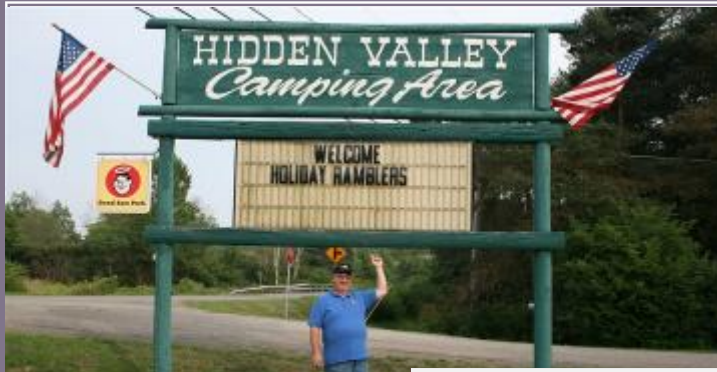
ON THE MARQUEE-HO