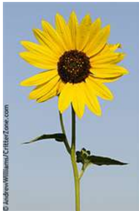
Kansas State Flower