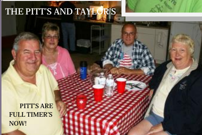
PITT'S ARE FULL TIMER'S NOW!