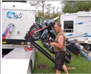
THE PITT'S AND TAYLOR'S